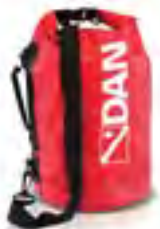
COMPACT DRY BAG